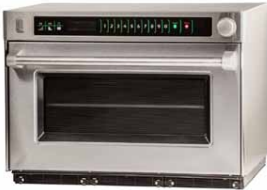
Model MSO5211 shown